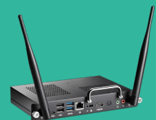
OPS2-i5 | OPS2-i7

Optoma offers optional full-fledged PCs with Intel Core i5 and i7 processors that slot into the Creative Touch IFP and enhance the computing capabilities. The Windows 10 operating system is not included, letting system administrators easily integrate the OPS2 1 slot-in PCs with existing volume licensing.