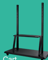
Cart ST01 (optional)