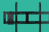
VESA Wall Mount with mini-PC bracket (optional)